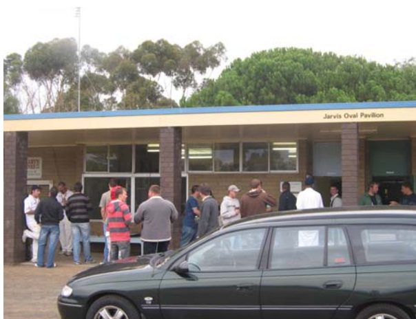
A Gathering outside the Jarvis Oval Pavilion after the Premiership success on Sunday arvo.