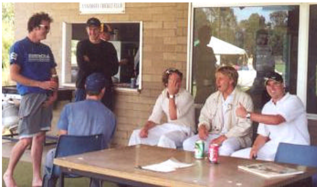
The 3rds Boys having a quiet one after the game!

"If you can't learn to do something well, learn to enjoy doing it poorly!"