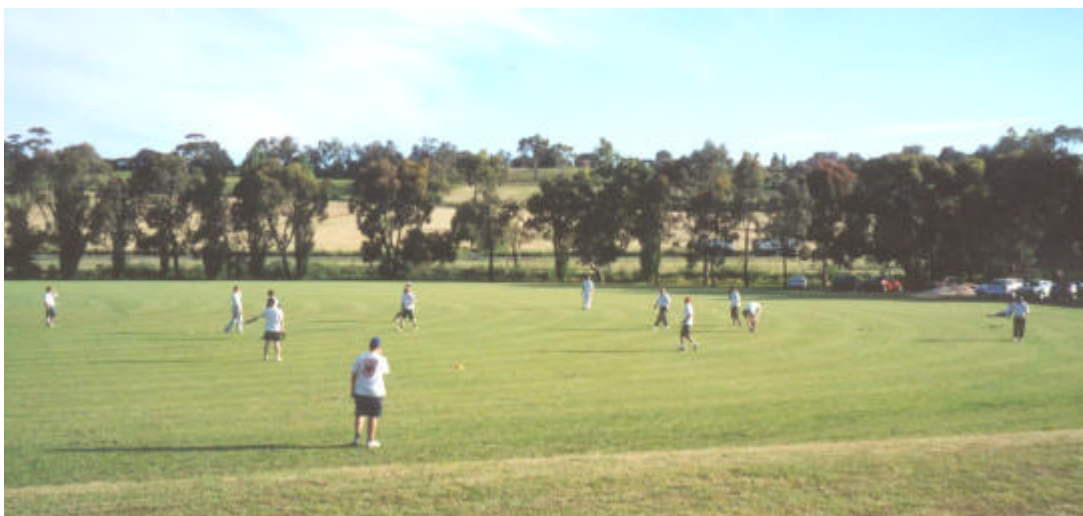
Jarvis Oval looking a picture!!

Corio sent us back and the situation went from bad to absolutely horrible. We were all out in the second innings for a record low 40 runs, with Jumbo the only batsman to score double figures. It was a disappointing day for us since we thought we had a realistic chance for coming away with a win. Sorry girls that we couldn't come away with a win.