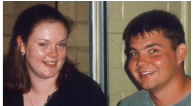
What a cute Couple!